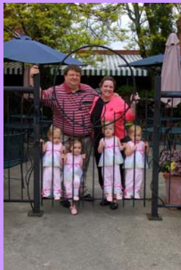
The Scrapbook Mamma and her family.

I am a mother of Quadruplet three year old daughters, who turned her hobby into a creative business. Let me make a book that you will cherish forever.